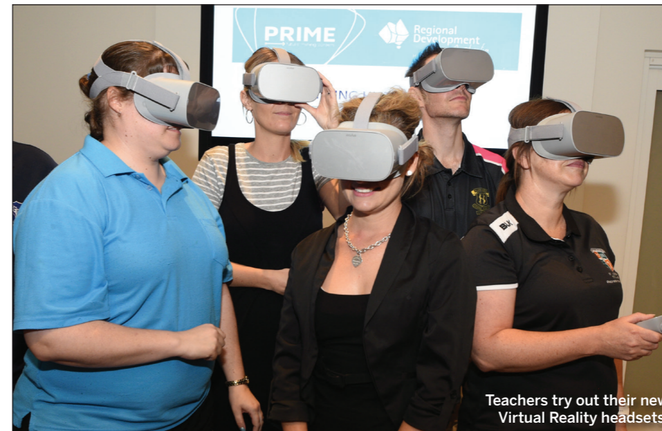
Teachers try out their new Virtual Reality headsets.

As always, the Dialogue welcomes new community participants. If you're interested in "helping make life better for all" in the Upper Hunter please contact us at info@nswmining.com.au . We would very much like to have a "dialogue" with you.