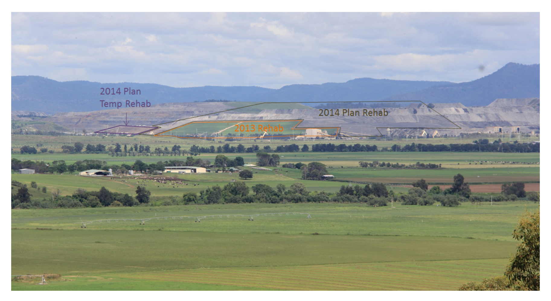
Figure 3. View of 2013 rehabilitation at MTW South Pit North. Rehab areas planned to be rehabilitated during 2014 are also shown. Vegetative cover will be established on a small area of temporary rehabilitation during 2014. Final rehabilitation cannot be completed in this area due to the location of maintenance infrastructure. Photo taken from Hambeldon Hill, Singleton.