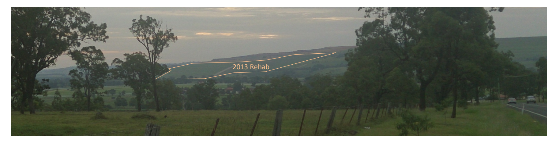
Figure 4. View of rehabilitation at Bengalla Southern Out-of-Pit Emplacement. Photo taken from Skelletar Stock Route, Muswellbrook.