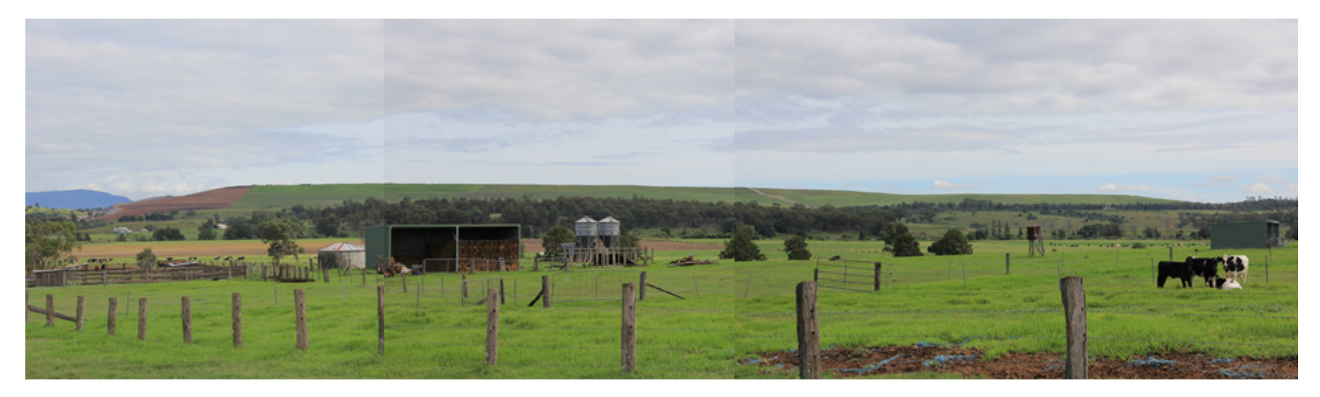
Figure 1. View of 2012 and 2013 rehabilitation in HVO Cheshunt. Topsoiled area shown on far left will be rehabilitated during 2014. Photos taken from Shearers Lane Maison, Dieu.